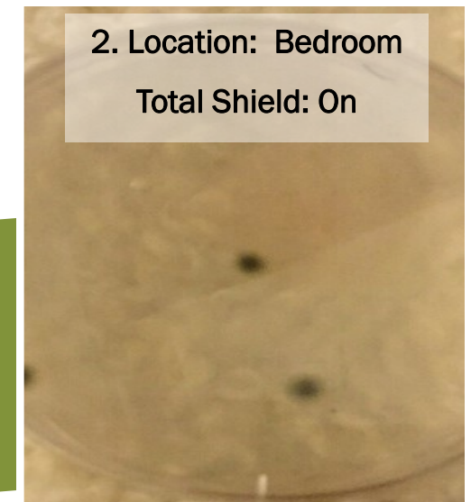
2. Location: Bedroom Total Shield: On